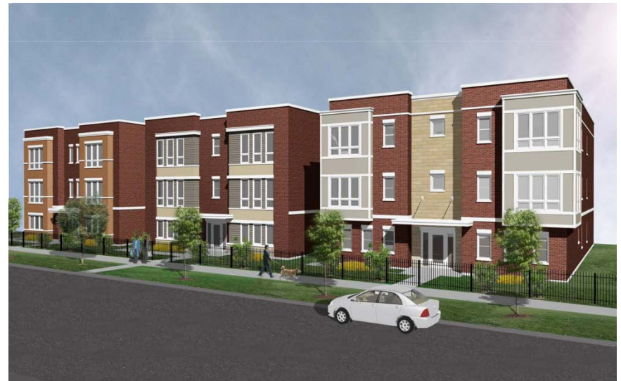
Six Flats Exterior Rendering