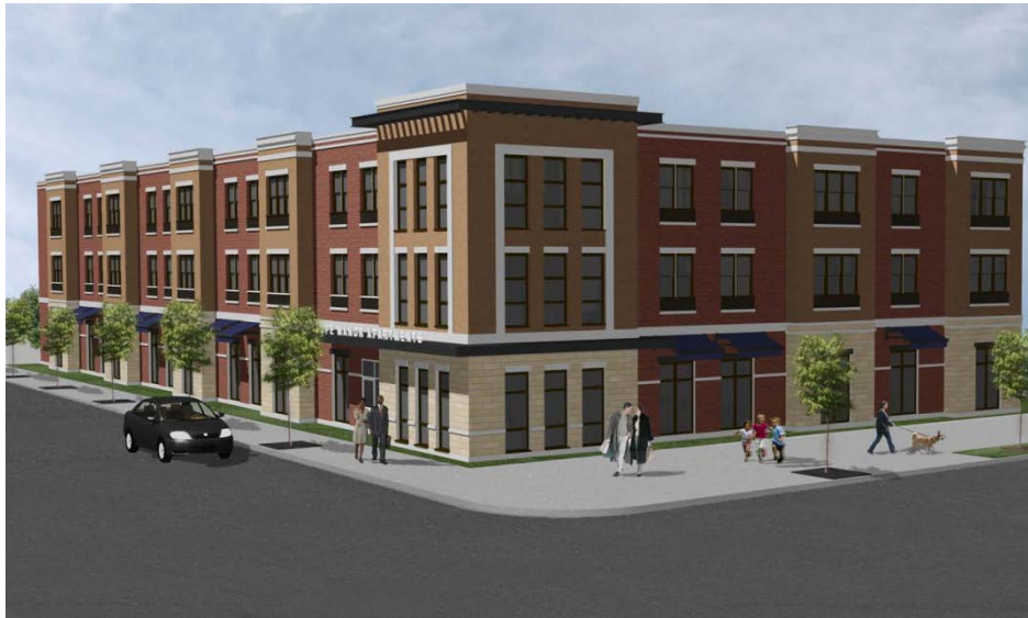
Main Building Exterior Rendering 60 th & Halstead