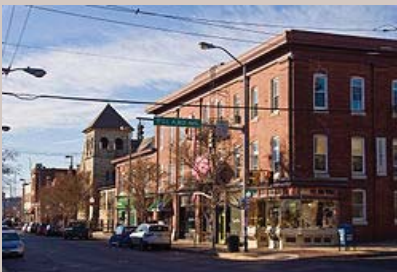
Above: Exterior view of tower and interior view; bottom: Hampden Historic District, Baltimore, MD.

The rehabilitation work met the Secretary of the Interior's Standards for Rehabilitation, creatively adapting the building to a new use while retaining its historic character and features. The project was also awarded the Baltimore City Green Standards Two Stars rating – the equivalent of LEED-NC Silver Certification from the United States Green Building Council. The preservation and reutilization of this former mill building will serve as an anchor and catalyst to the positive redevelopment momentum in a portion of Baltimore City that is seeing a rebirth in recent years.